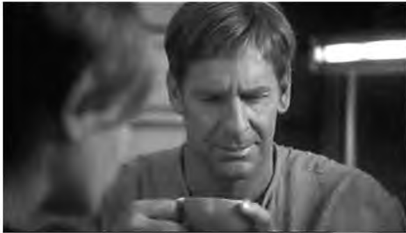
Star Trek:Enterprise – “Twilight”

difficult issue and trying to make sure that it came out clearly—without providing an opinion—by presenting an issue and letting people have their own conversations about it. I remember that being particularly challenging.