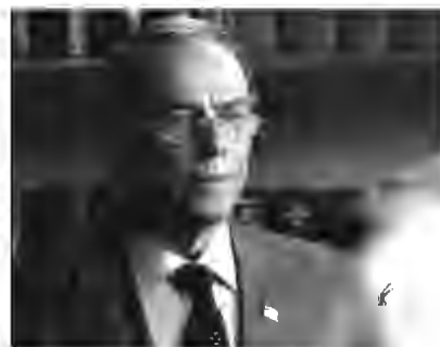
"(Bolton) threatened me & I don't like being threatened."

Harm stands before Sheffield again after the seaman refuses the offer, demanding his acquittal. Sheffield is disconcerted about the refusal, but Harm explains that some things are more important than freedom. Sheffield's face allows us to see a man weighing all his options and one who can instantly make a decision. He reveals that Bolton actually threatened him.