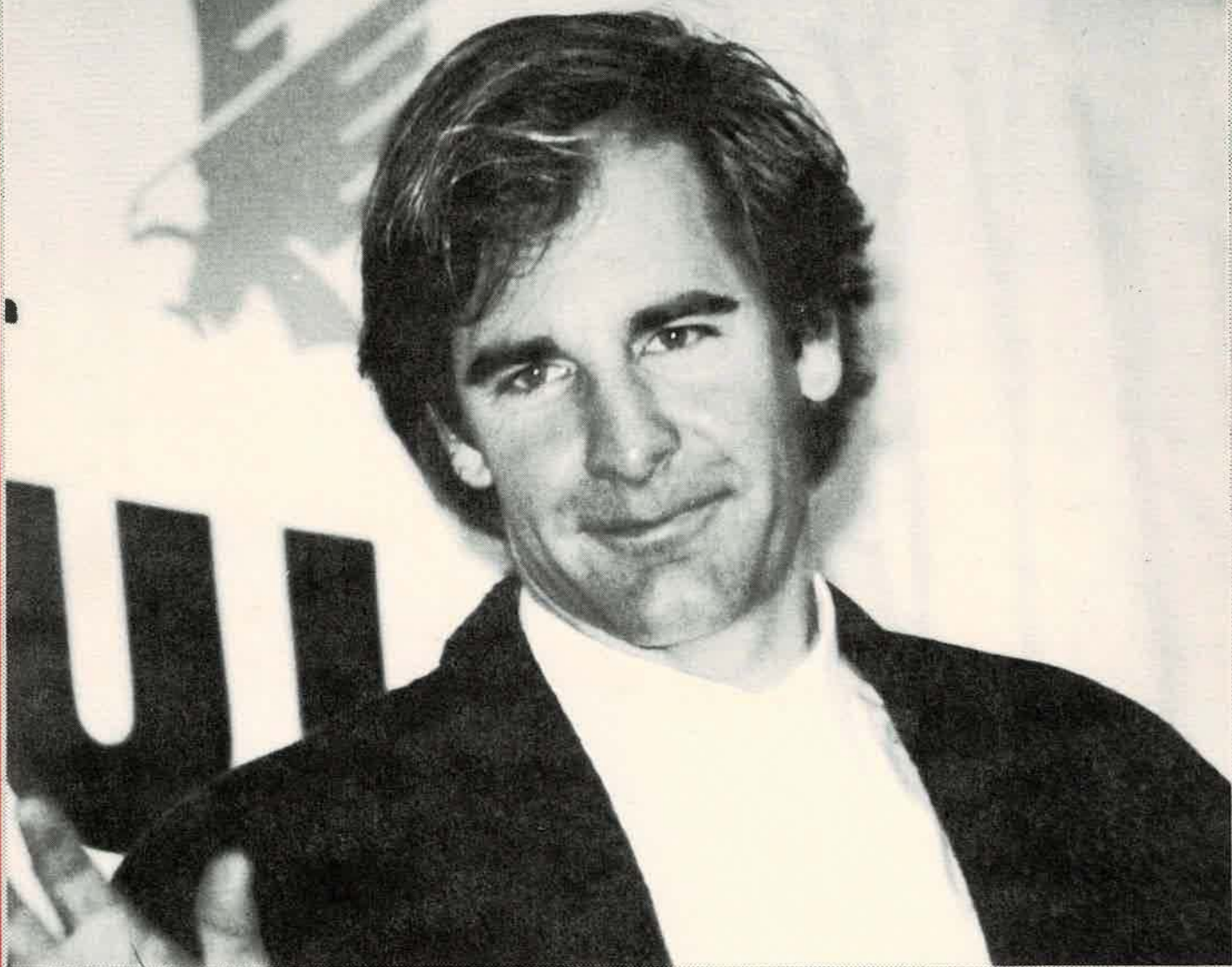
Quantum Physicist Dr. Sam Beckett

A scientist and an ex-astronaut team up to ask: is Time, not Space, the final frontier?