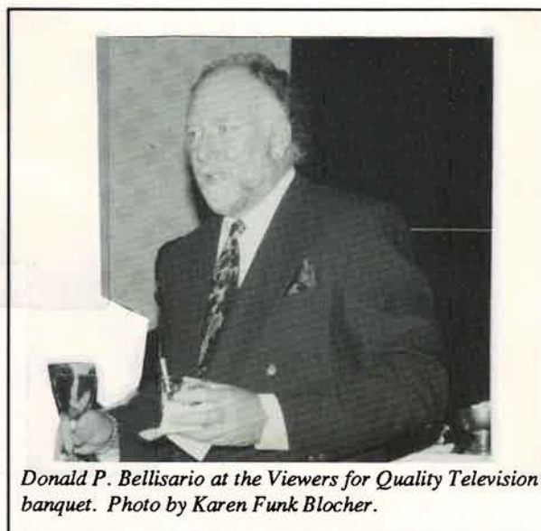
Donald P. Bellisario at the Viewers for Quality Television banquet.